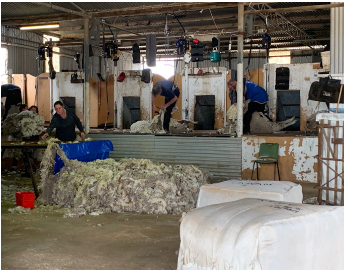
Pic 2. Shearing Echidna