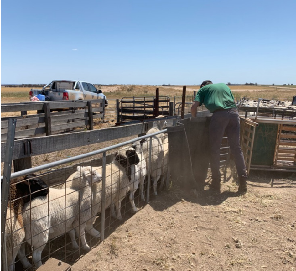
Pic 3. Weighing Lambs Mallee Valley