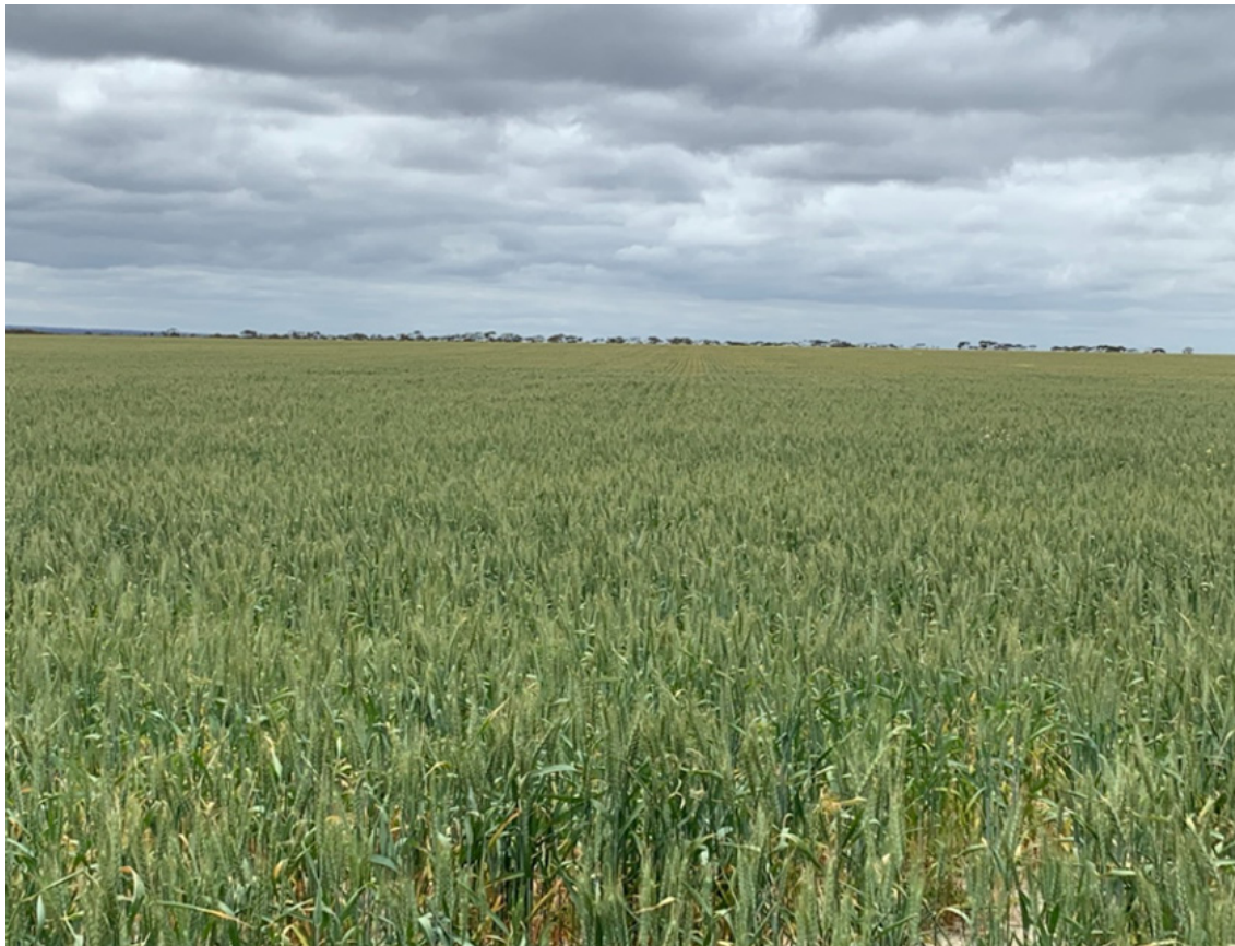
Pic 3. Crops – Echidna