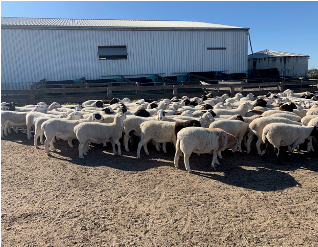
Pic 1. Lambs ready to be loaded on truck