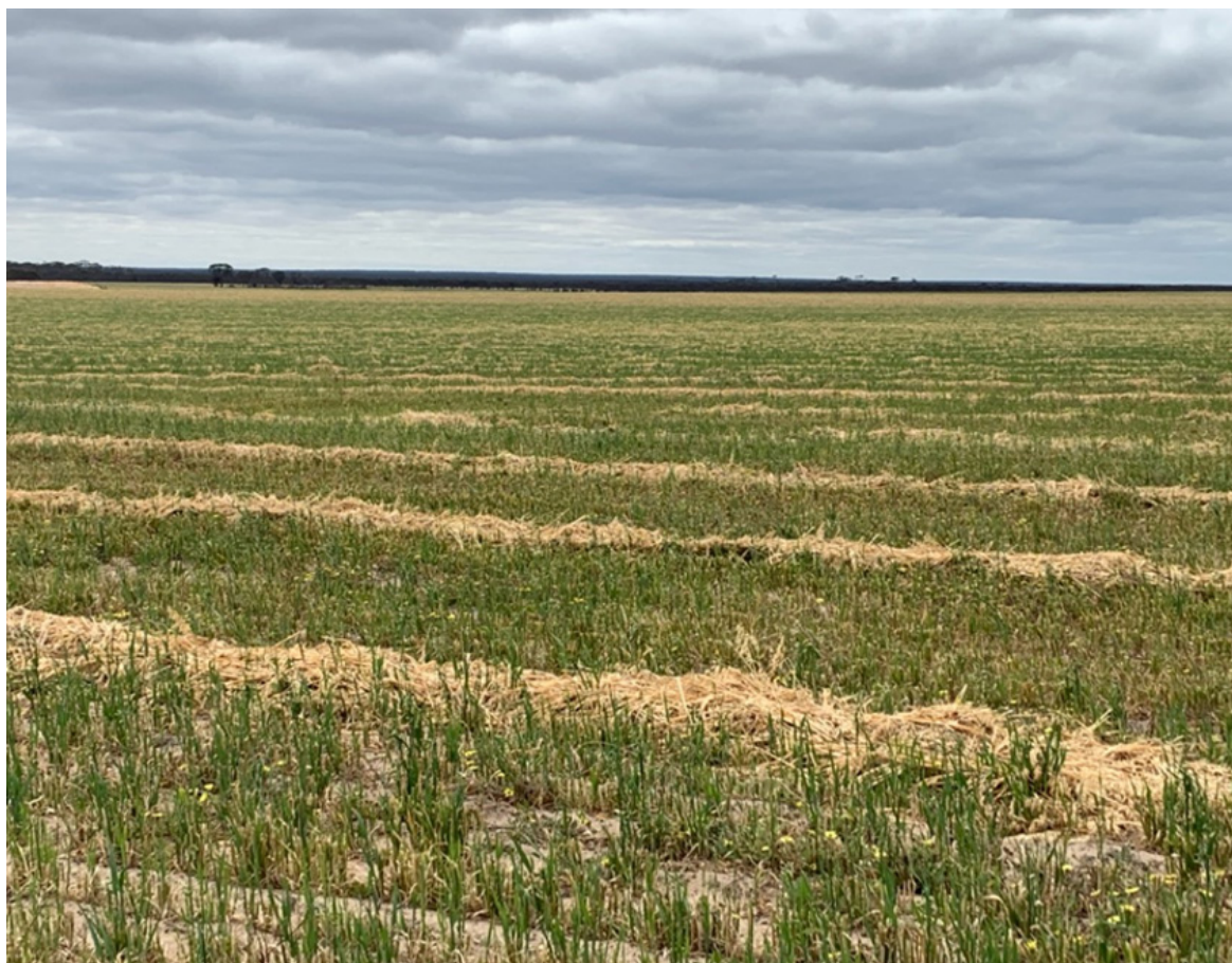
Pic 4. Hay – Echidna